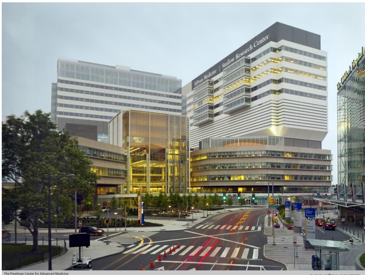
The Perelman Center for Advanced Medicine